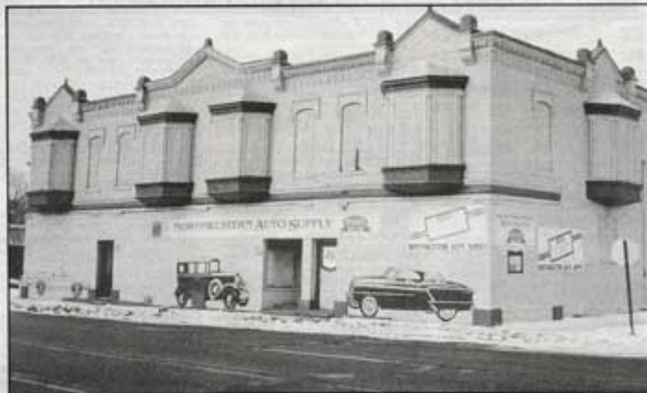
Northwestern Auto Supply takes up most of a city block and is entirely filled with old car parts, from the cellar to the attic.